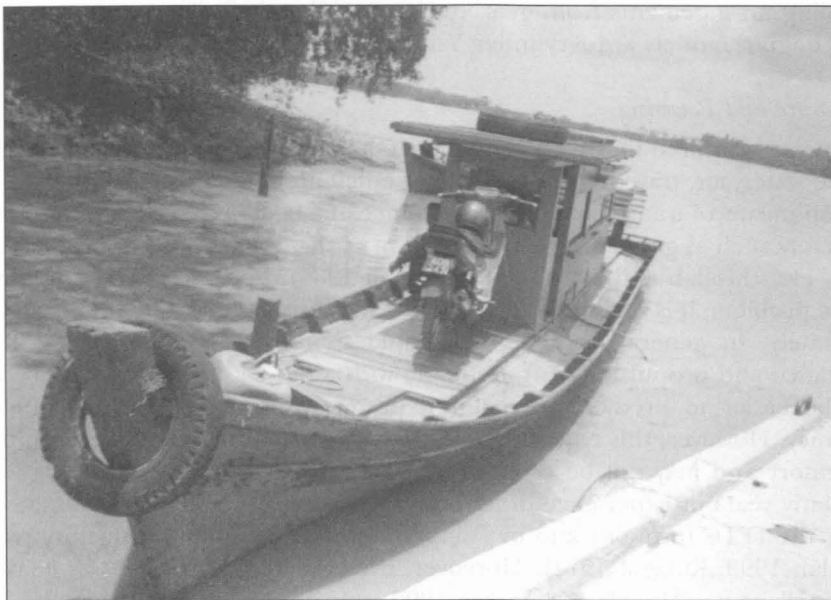
Fig. 1: A typical fishing boat in lower Perak River

The purpose of study is to find out the power requirement and the optimum propeller parameters to improve the fuel efficiency for the operation of the fishing boats. Analysis is performed on the basis of the hull specification of a wooden boat, which is commonly found in the lower Perak River of Malaysia as shown in Fig. 1 .